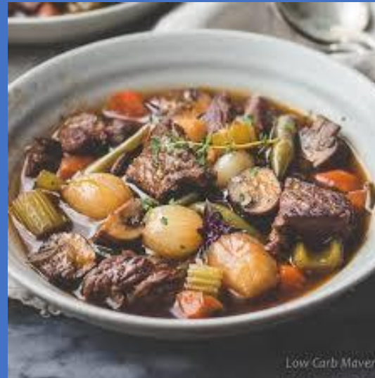
Low Carb Maven

Tickets £18 must be purchased from the secretary by 4th November to include Draw tickets. Tickets cannot be purchased after this date